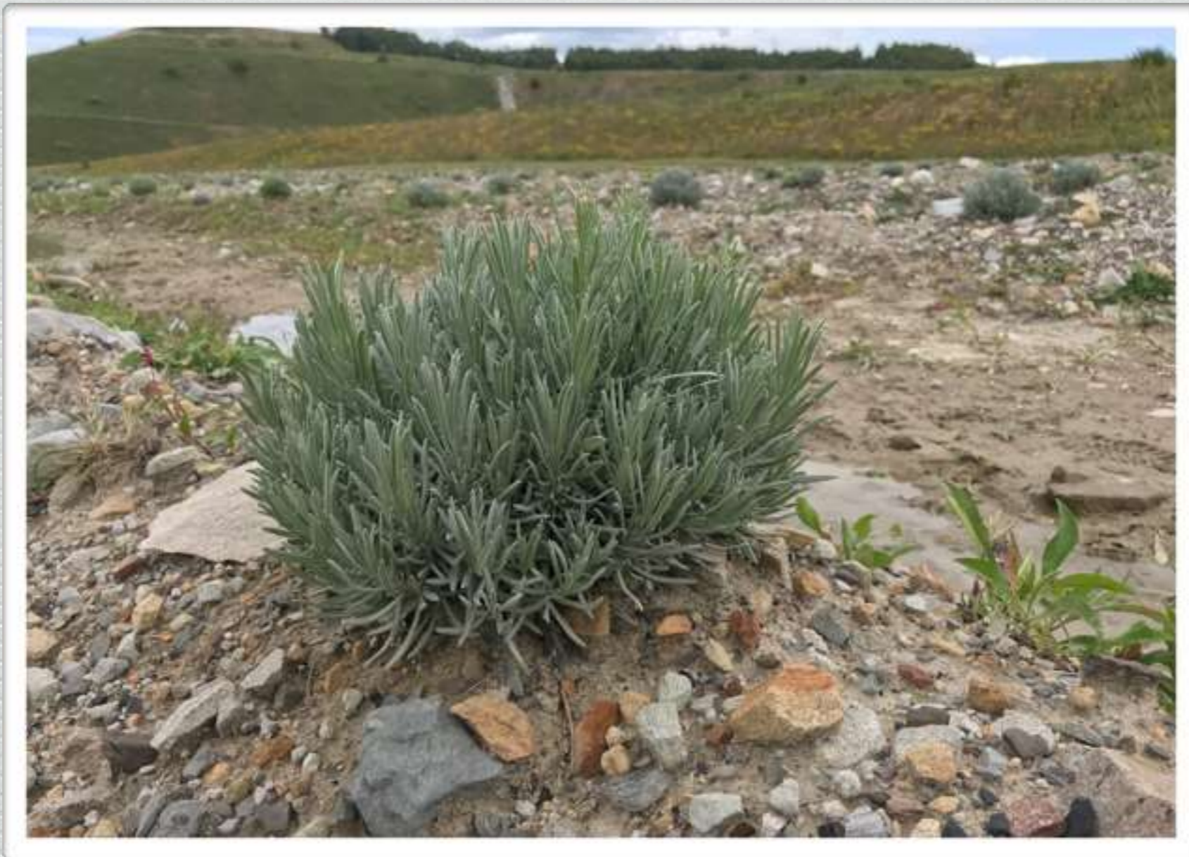
Demo Site Plant